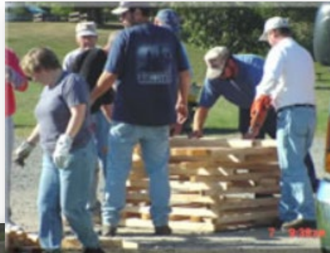
Tioga-Hammond/PA Fish & Boat Commission Fish Habitat Improvements