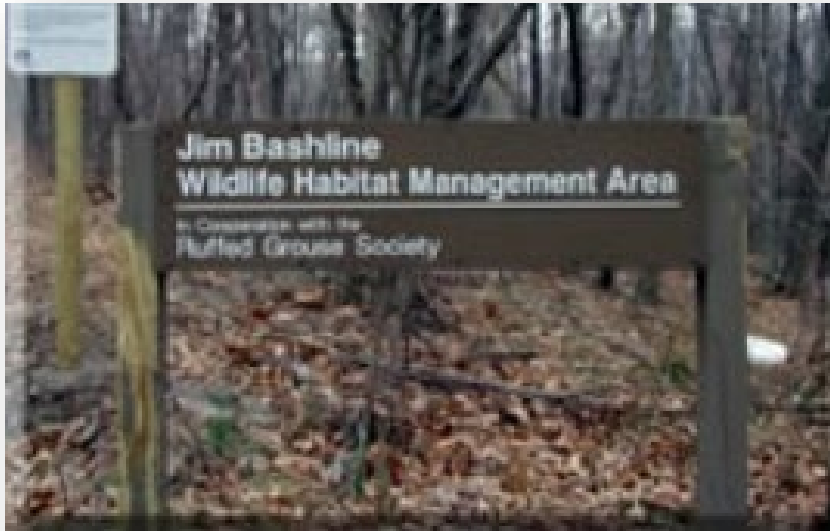
Raystown/Ruffed Grouse Society WMA

However, if the potential partner requests a local MOU as a condition to partner with the Corps, you may use the National MOU as a model example to create a local version.